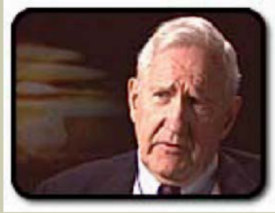
Dr. Harold Agnew Nuclear Pioneer

Plan to join us Tuesday, November 28, 2000 for a Gala Banquet and the 9th Annual Teller Lecture. This event will culminate our yearlong celebration of the Savannah River Site's 50th Anniversary. It will include a reception, fireworks display, dinner, and a talk by Dr. Harold Agnew, a world-renowned nuclear pioneer. Tickets will be available in late September at the ORA at SRS, the CNTA Office, and area Chambers of Commerce. Tickets are $35.