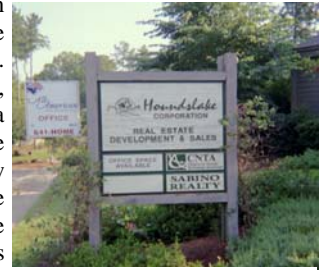
CNTA office sign at 920 Houndslake Drive in Aiken