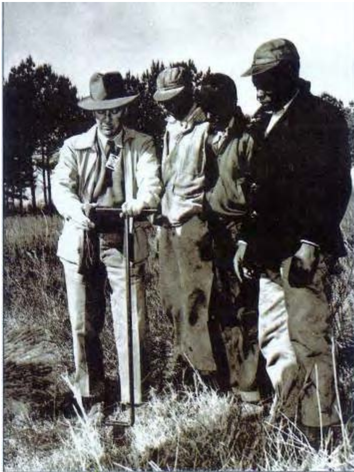
Unidentified workers were instructed on hole digging, while others were taught how to plant from the three-seated tractor equipped with buckets to facilitate planting.