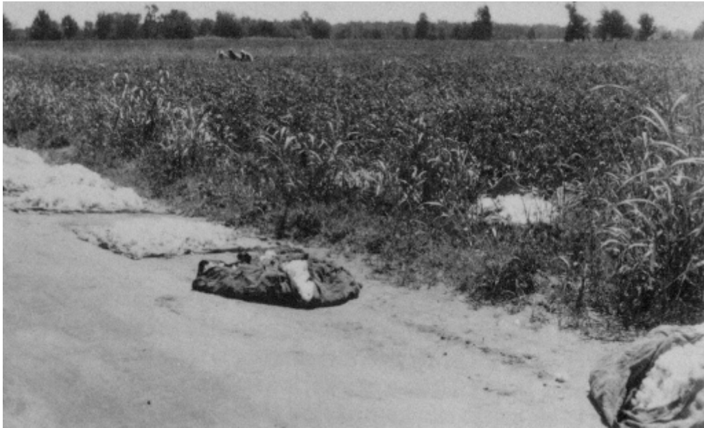
Picking cotton in the 1950s