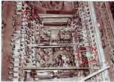
This photo shows a mockup canyon cell used for training. The red circles indicate Hanford connectors from the banks of them along the walls. Negative DPSPF 7224-15 courtesy of SRS Archives.

This 3/5 scale model represents a Hanford Connector, also known as a "jumper." This piece of technology was designed at Hanford and also used at SRS. It is fitting, since the Savannah River canyon buildings were also based on the Hanford Cell Building, comparable in function to the hot canyon process areas of SRS.