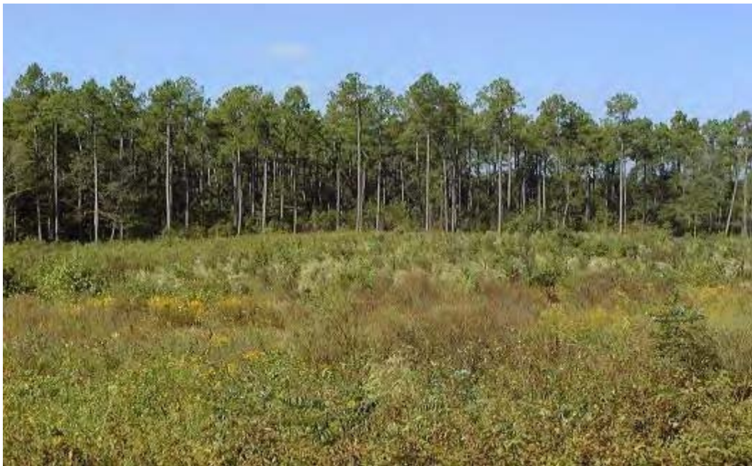
Results of reforestation of SRS

NEWS FLASH.....The date of New Ellenton's Atomic City Festival is on October 10 and 11— the SRS Heritage Foundation will be taking oral histories and accepting memorabilia. More information to come!