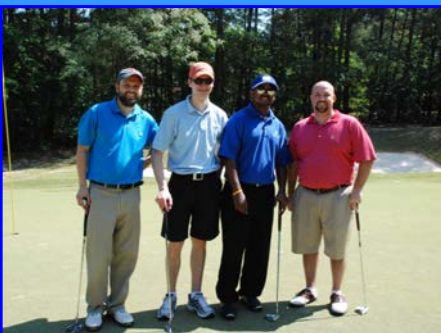
LEAP (SRNS) —3RD PLACE LOW NET