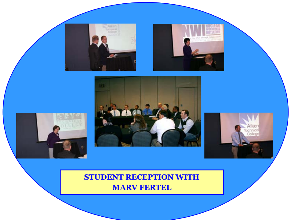
STUDENT RECEPTION WITH MARV FERTEL