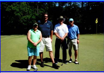
SRNS #2—LOW GROSS