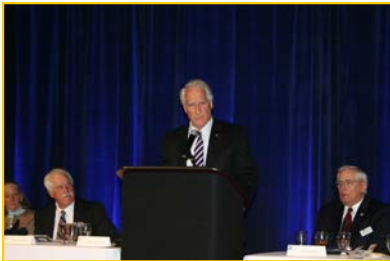
Bringing Nuclear into the Classroom