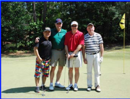
B&W #2—1ST PLACE LOW NET