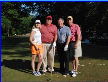
PENN TOOL—2ND PLACE LOW NET